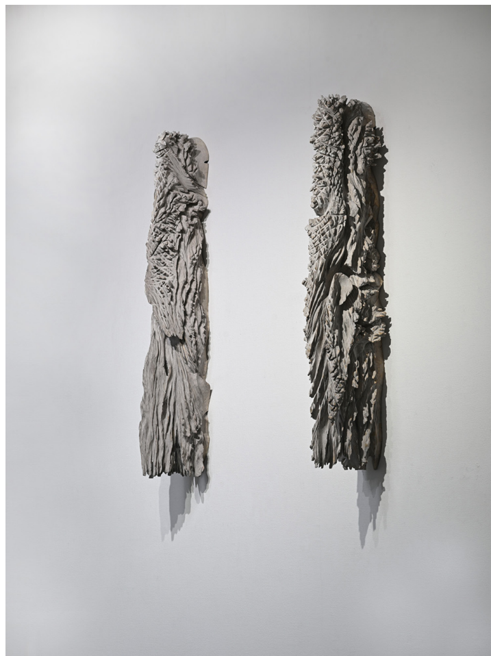
Shigeo TOYA, Metamorphosis into Woods II , 2003, wood, wood ashes, acrylic, 155x30x36cm(left), 155x32 x 38cm(right)