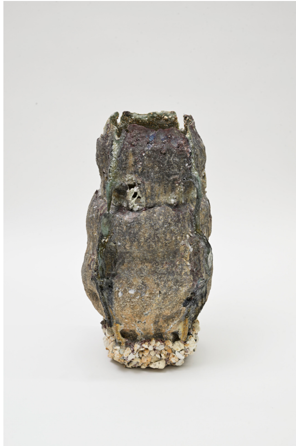
Masaomi YASUNAGA, Melting vessel , 2024, glaze, colored glaze, slip, copper, kaolin, 60x38x39cm