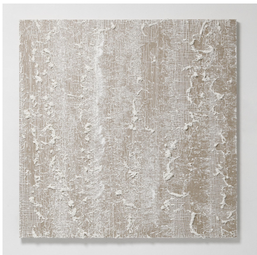
Yoriko TAKABATAKE, Bathing, sands 2020, oil on canvas, 142x142cm

◆Other artists' news are available on : http://shugoarts.com/en/topics/