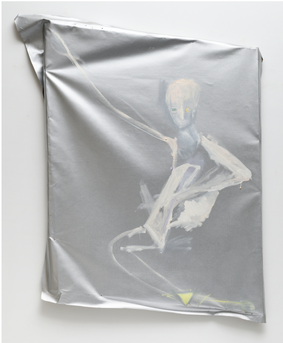
Masato KOBAYASHI, Painter and Light , 2007/2013, oil, acrylic, canvas, wood, 178x159cm