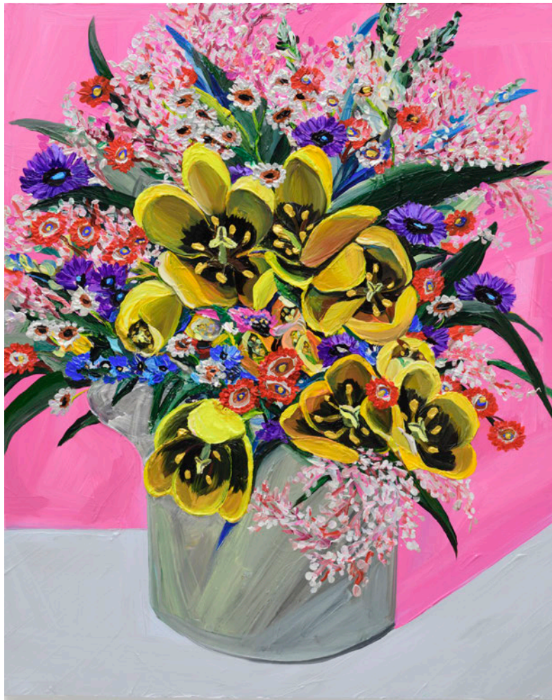
Aki KONDO, Flowers for the Happy Day , 2019, acrylic on canvas, 91x72.7cm

◆Other artists' news are available on : http://shugoarts.com/en/topics/