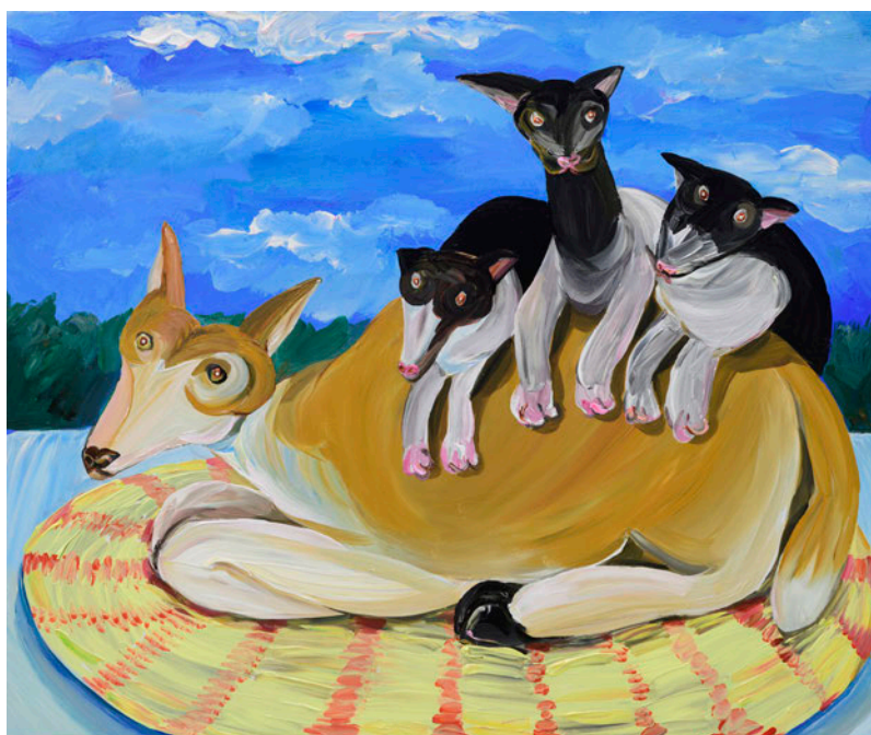
Aki KONDO, Living in the Wilderness , 2020, acrylic on canvas, 60.6x72.7cm