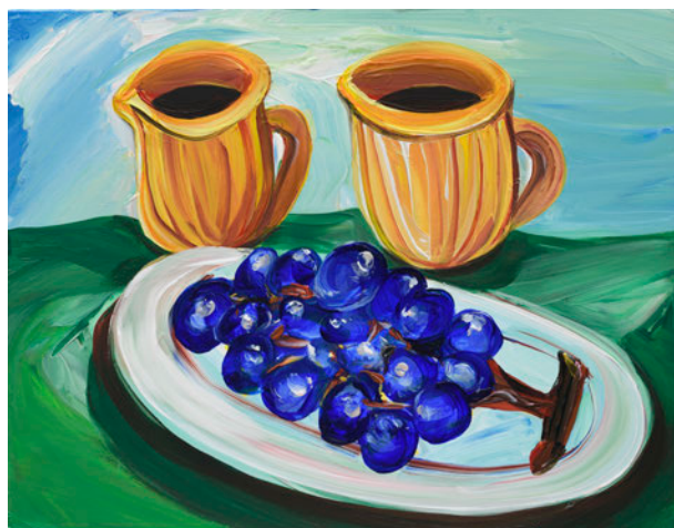
Aki KONDO, Having Some Coffee with You after the Rain , 2020 acrylic on canvas, 31.8x41cm

Open every day (Please see the website for opening hours.)