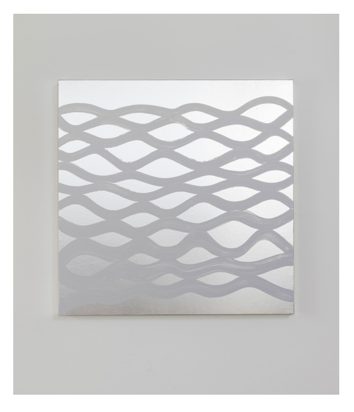
Anju Michele, wave , 2020 oil on aluminum paper mounted on panel, 60x60cm