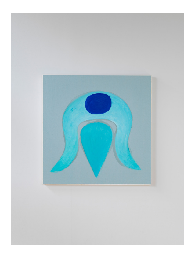
Anju Michele, ritual , 2020 oil on Japanese paper mounted on panel, 65x65cm