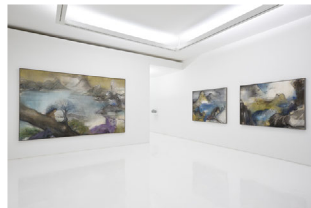
Leiko IKEMURA, installation view of After another world , 2017, ShugoArts