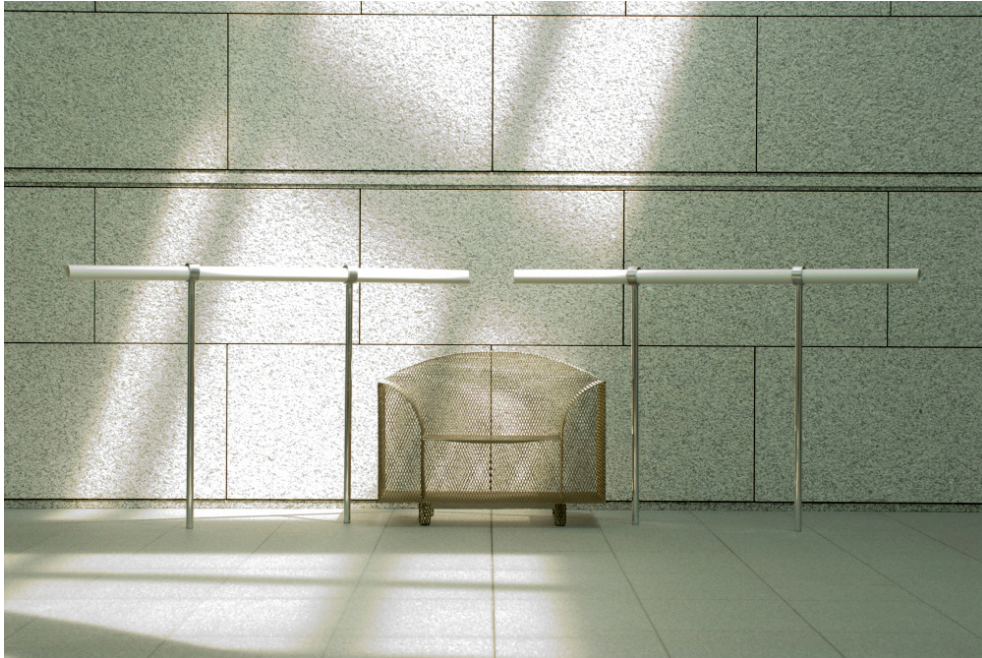
EARS WITH CHAIR (MOT) , 2007