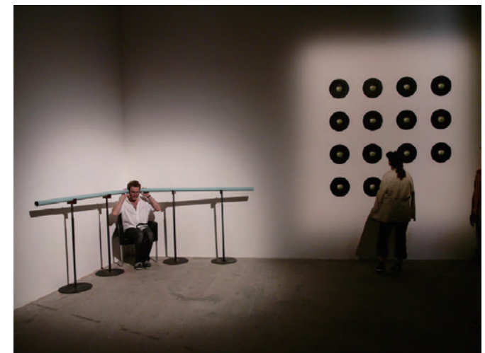
Installation view of EARS WITH CHAIR / DELETE , 2007, The 52nd Venice Biennale, Venice

『YUKIO FUJIMOTO memo to work』 2003 pp.68-89