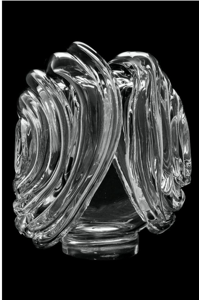
Ritsue MISHIMA, VITA , 2019, glass, 46.5x39cm

ShugoArts complex665 2F, 6-5-24, Roppongi, Minato-ku, Tokyo 106-0032