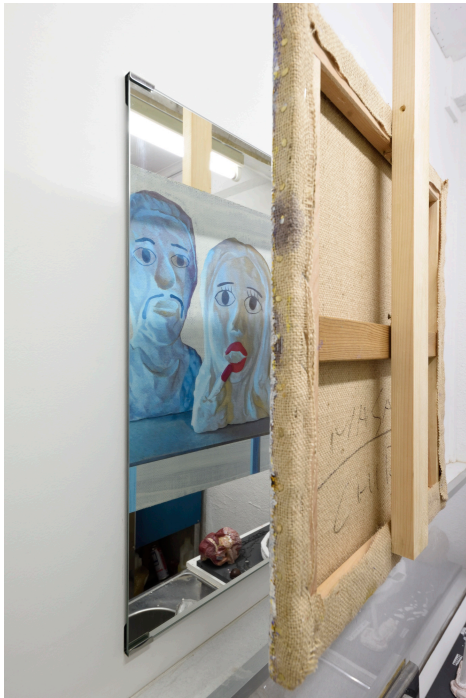
Masaya CHIBA, The Gods of our Gods are you (plural) 2018, oil on canvas, mirror, wood canvas: 53 × 45.4cm, mirror: 60 × 50cm *installation view at The Steak House DOSKOI, 2018