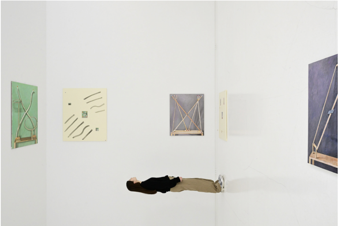
Sideward Exhibition, 2023, ShugoArts