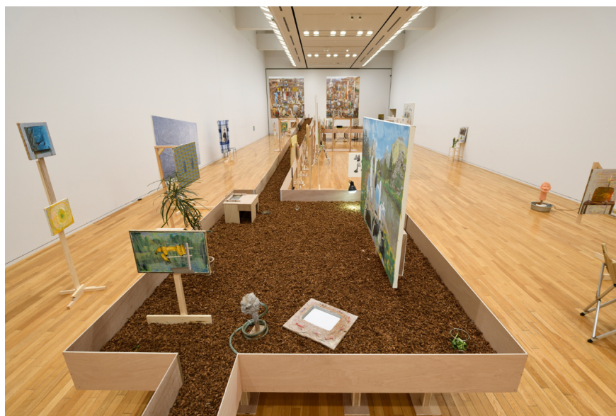
Masaya Chiba Exhibition , 2021, Tokyo Opera City Art Gallery

Masaya Chiba created large-scale paintings utilizing multidimensional compositions up until the mid-2010s that intricately combined images, objects, and text. From around 2016–2017, however, his works began to shift toward smaller formats with more simplified backgrounds. At the same time, Chiba continued to experiment with refreshing the viewer's experience of painting. For example, in his solo exhibition at Tokyo Opera City Art Gallery in 2020, the show was developed from the perspective of his pet turtle. In his Sideward Exhibition at ShugoArts in 2023, he created a space that evoked the sensation of the entire venue being rotated 90 degrees, generating a strong sense of visual and physical disorientation.