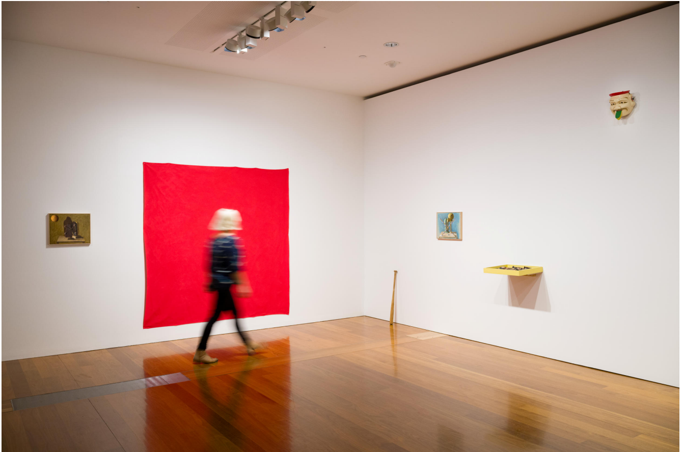
The 11th Asia Pacific Triennial of Contemporary Art, 2024-2025, Queensland Art Gallery & Gallery of Modern Art