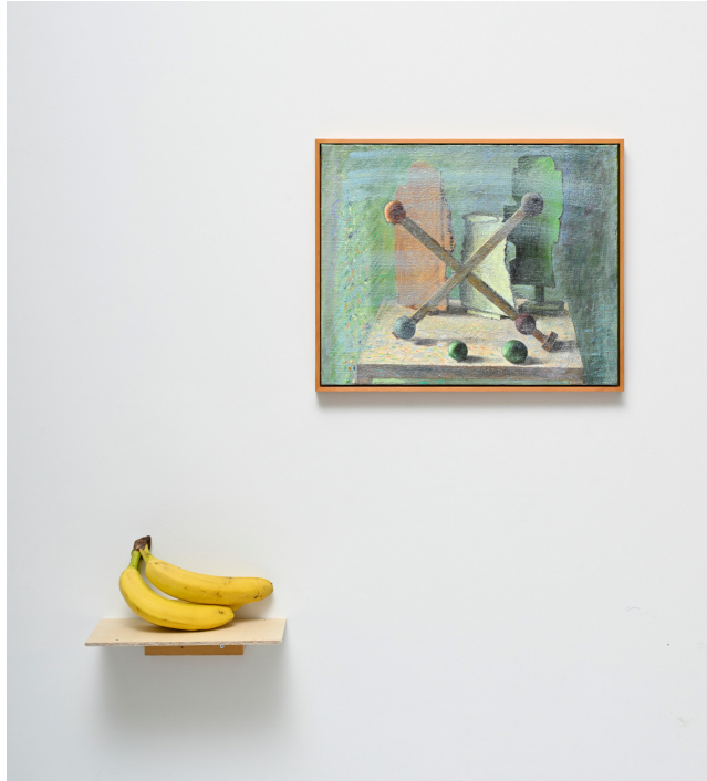
Masaya CHIBA, Painting and Vegetable #14 (Square Through the Trees) , 2025, oil on canvas, panel, vegetable, wood, 35x42.8cm

Masaya Chiba created large-scale paintings utilizing multidimensional compositions up until the mid-2010s that intricately combined images, objects, and text. From around 2016–2017, however, his works began to shift toward smaller formats with more simplified backgrounds. At the same time, Chiba continued to experiment with refreshing the viewer's experience of painting. For example, in his solo exhibition at Tokyo Opera City Art Gallery in 2020, the show was developed from the perspective of his pet turtle. In his Sideward Exhibition at ShugoArts in 2023, he created a space that evoked the sensation of the entire venue being rotated 90 degrees, generating a strong sense of visual and physical disorientation.