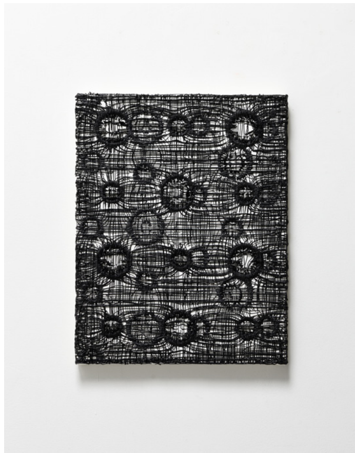
Yoriko TAKABATAKE, MARS , 2020 acrylic, pigment, iron sand on canvas, 41x32cm